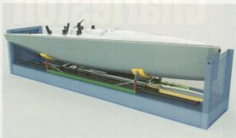
Stacked and ready to move, the Farr 400's custom cradle shows the boat in its keel-off configuration. The rack accommodates the hull, keel bulb, fin, boom, and two-part carbon rig.

STS-12-75 is the latest innovation in high performance cordage solutions from New England Ropes.